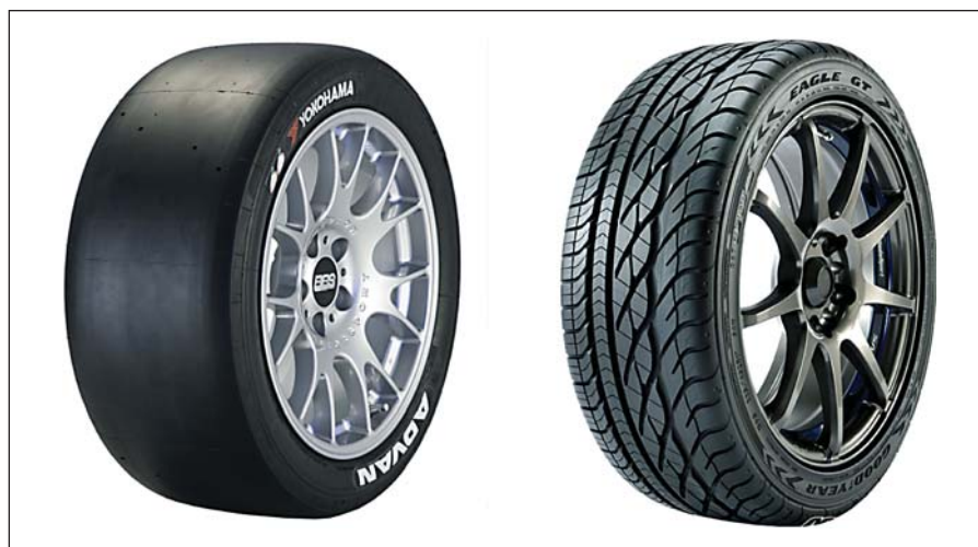
Fig. 2. Smooth tires such as the racing tire (left) provide the best grip in dry conditions. In wet conditions, however, rain treads (right) are better. Here, we explore the hypothesis that, although smooth fingertips provide the best grip in dry conditions, fingertips wrinkle in wet conditions for better grip, akin to rain treads.