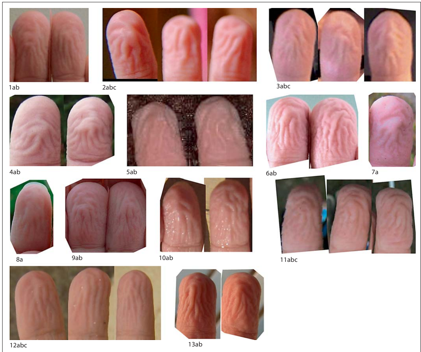
Fig. 4. Wet-wrinkle networks on 28 fingers from 13 hands. These were found in the public online domain and were kept so long as the image was sufficiently sharp to see the wrinkles.

response. Wilder-Smith [2004] provides evidence that the finger-wrinkling mechanism may be due to digit pulp vasoconstriction: wet-induced wrinkles are accompanied by vasoconstriction [Wilder-Smith and Chow, 2003a], and wrinkles are induced by vasoconstrictive agents [Wilder-Smith and Chow, 2003b; Wilder-Smith, 2004].