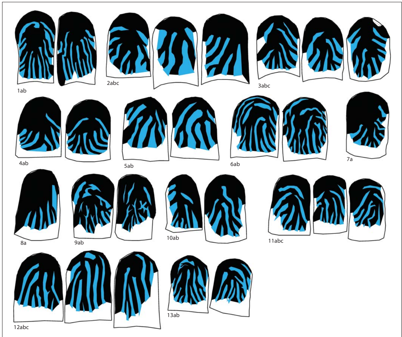
Fig. 5. Channel-like troughs in finger wrinkles (light blue; color refers to online version only), and the borders between them (black), for the fingers in figure 4. The signature of a drainage network on a convex promontory (see fig. 3b, d) is readily apparent; disconnected channels diverge from one another away from the peak, and divides form a connected tree with its root at the peak.

another uphill. However, drainage networks are dramatically different in topographies such as convex promontories, where roughly the ‘opposite’ is found: the channels are disconnected from one another and diverge away from one another downhill, and divides link together to form a tree with its trunk at the promontory’s peak (fig. 3b).