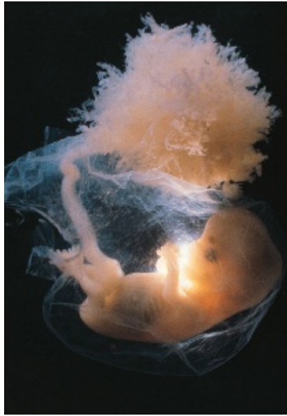
Depleted residual falls a week later, leaving the cord as a souvenir