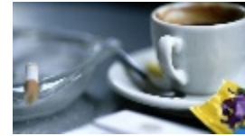
I'm addicted - what things storm in Italy