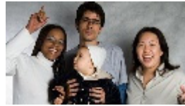
Do not call me black