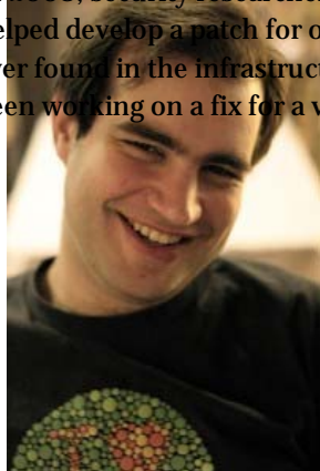
Security researcher Dan Kaminsky wearing a shirt that reads "I (heart) color." It's illegible to the red-green colorblind.

In 2008, security researcher Dan Kaminsky discovered and helped develop a patch for one of the most fundamental flaws ever found in the infrastructure of the Internet. Lately he's been working on a fix for a very different infrastructure